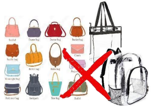
BAGS OF ANY KIND