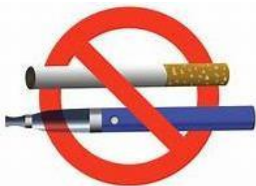
CIGARETTES & ALCOHOLIC DRINKS