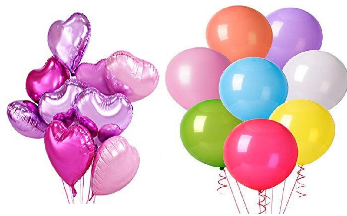
Balloons (All types)