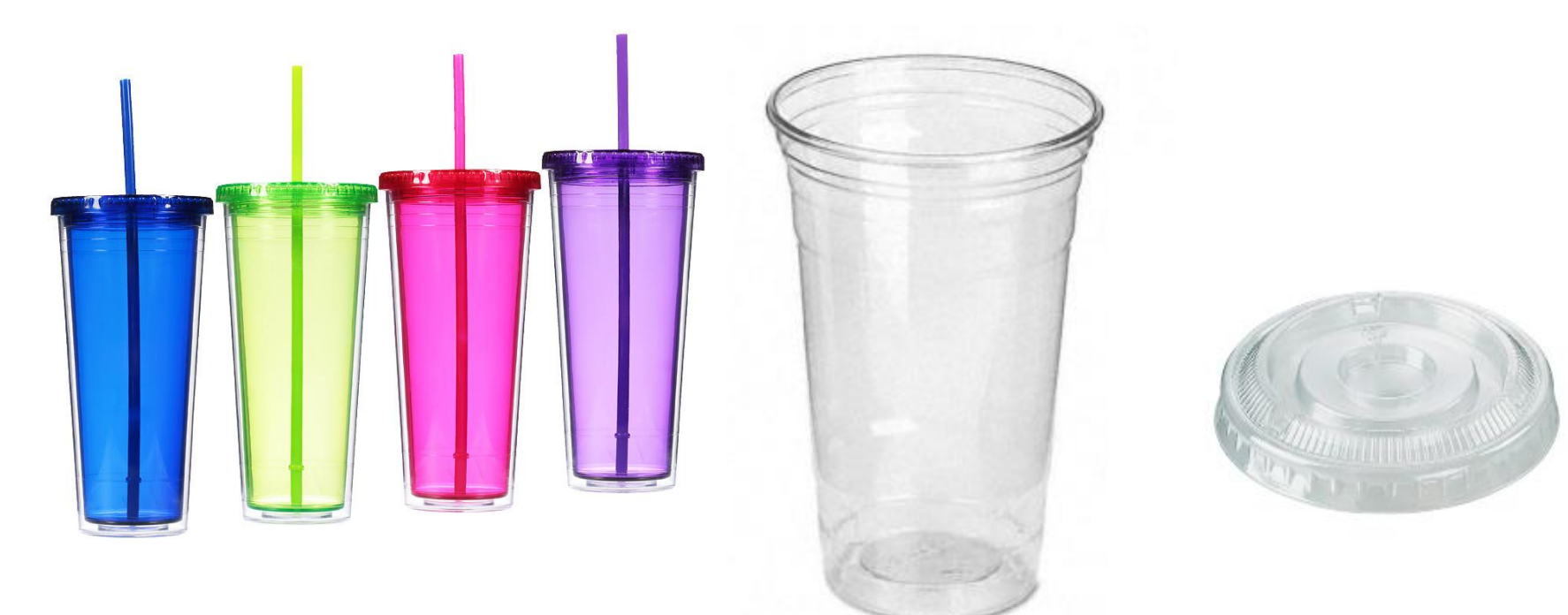
Plastic Cup & Lid