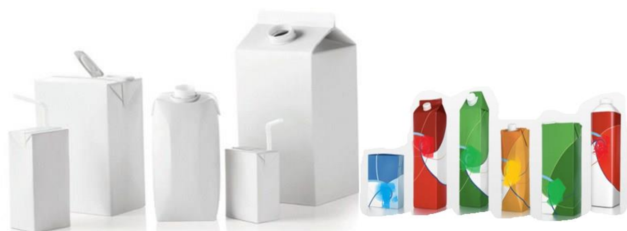
Tetra Pak Cartons