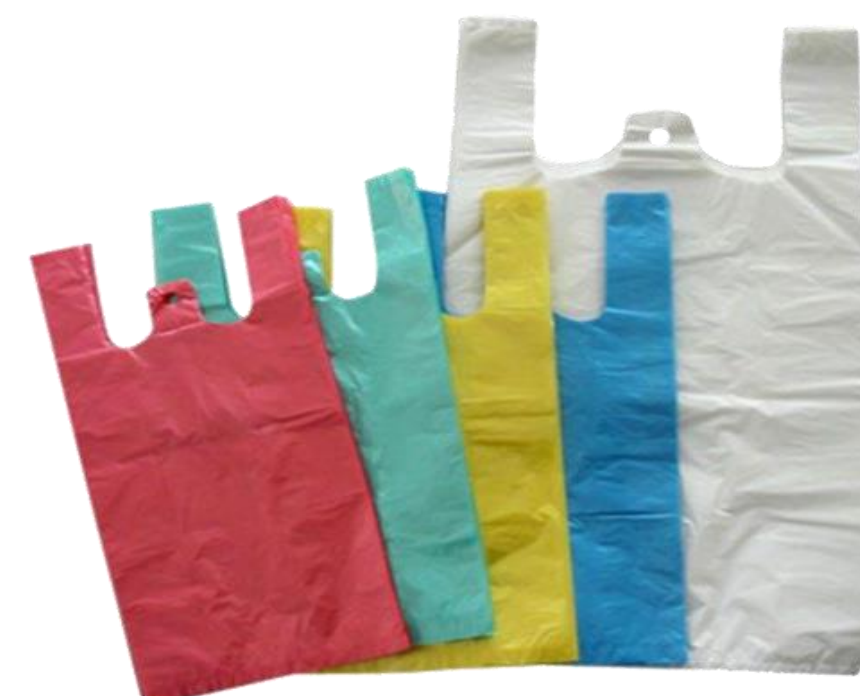
Sando bags and Other plastic bags