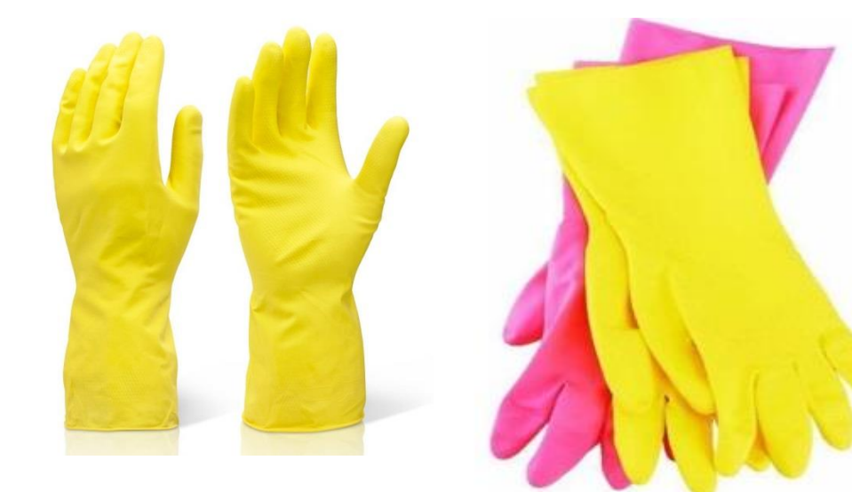
Plastic / Disposable Gloves