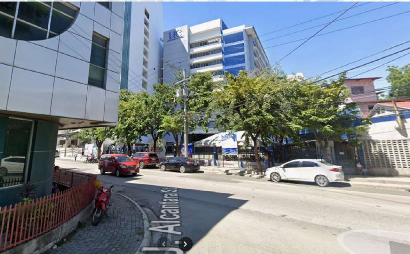
University of Cebu Main Campus - Prime SHS J. Alcantara St. Cebu City, Cebu (Near Cebu City Sports Center)