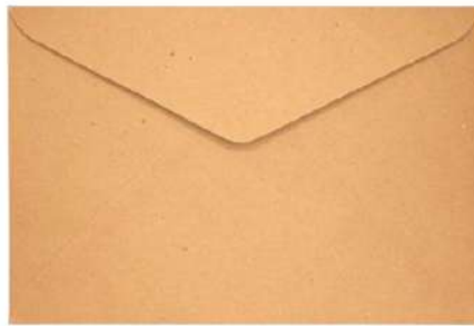
One (1) piece long brown envelope