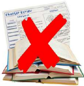
BOOKS, NOTES, REVIEW MATERIALS

REVIEW MATERIALS, DEADLY WEAPONS, BAGS OF ANY KIND, CIGARETTES/VAPES, ALCOHOLIC DRINKS, PROGRAMMABLE CALCULATORS, CELLULAR PHONES, SMART WATCHES, BLUETOOTH EARPLUGS, PORTABLE COMPUTERS, BLUETOOTH AND ELECTRONICS GADGETS/DEVICE WHICH MAY BE USED TO RETRIEVE DATA/INFORMATION AND/OR TO COMMUNICATE FOR WHATEVER PURPOSE ARE NOT ALLOWED INSIDE THE SCHOOL/TESTING PREMISES.