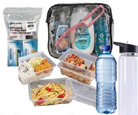
Packed snacks, meals, and necessary medications, including hygiene and sanitary kits, in TRANSPARENT/CLEAR containers/cellophanes (paper containers are not allowed)