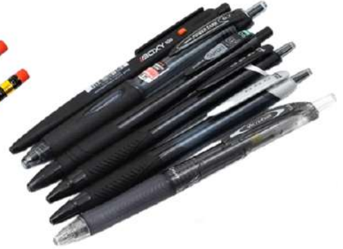
Ball pens with black ink only (no sign pen or fountain pen)