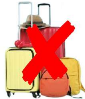
BAGS OF ANY KIND