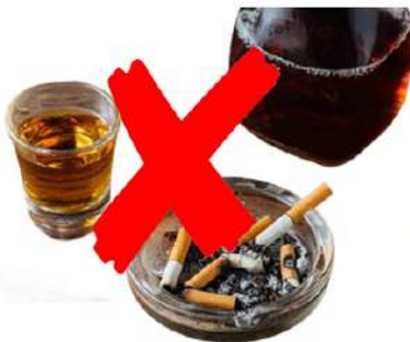
CIGARETTES & ALCOHOLIC DRINKS