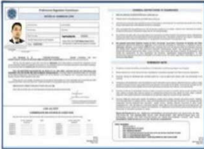
Notice of Admission (NOA)

Relative to this, all examinees of NCR are required to bring the following: