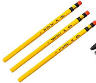
Two (2) or more pencils (No. 2)