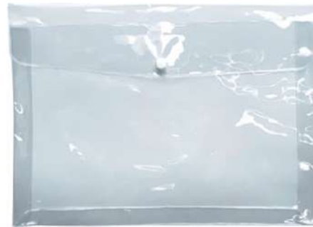
One (1) piece long transparent / plastic envelope (for keeping your valuables and other allowed items)