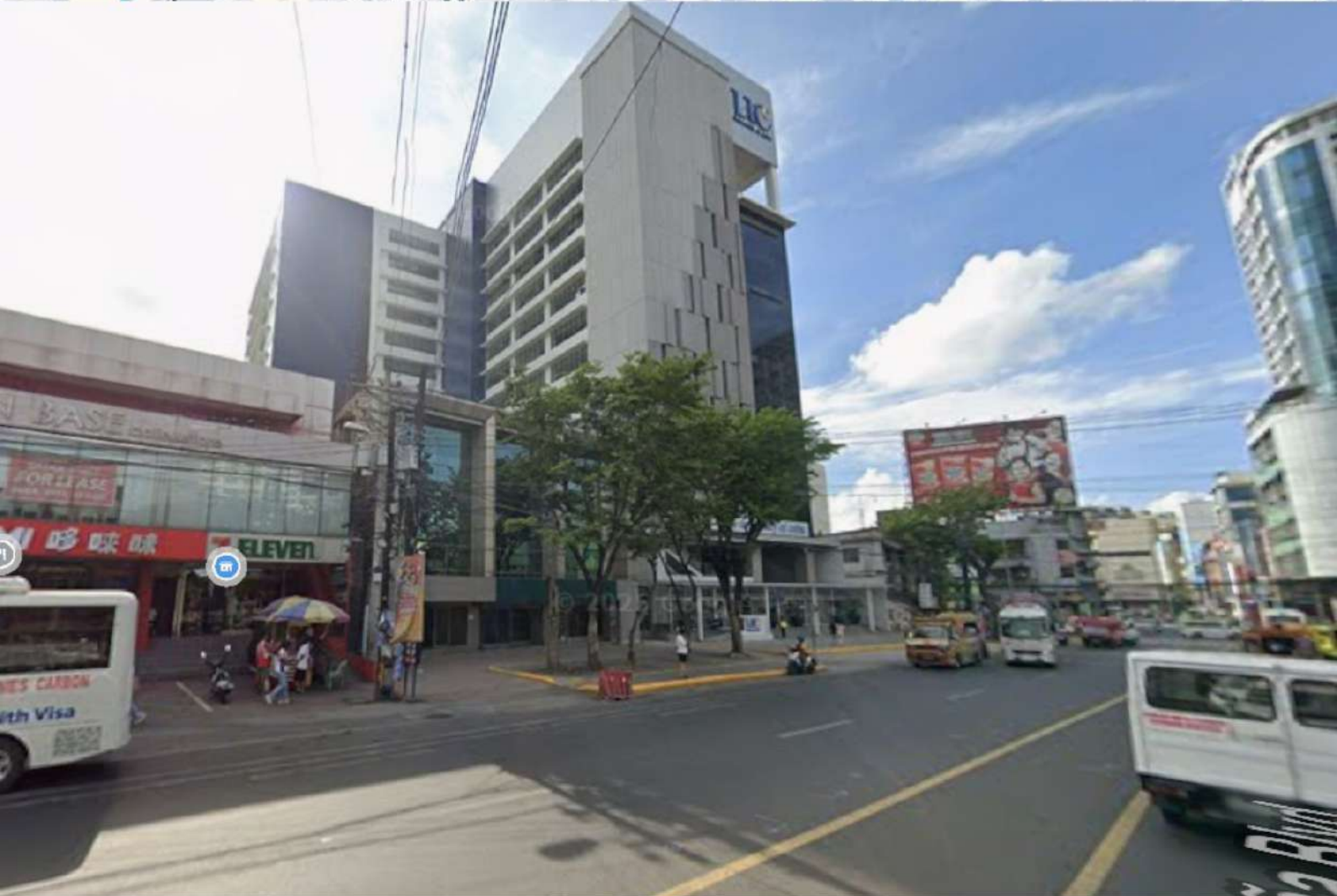
University of Cebu Main Campus - Jones Building Barba Press Building, 715 Osmeña Blvd, Cebu City, Cebu