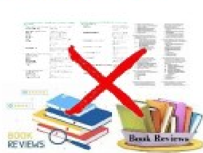
BOOKS, NOTES, REVIEW MATERIALS

REVIEW MATERIALS, DEADLY WEAPONS, BAGS OF ANY KIND, CIGARETTES, ALCOHOLIC DRINKS, PROGRAMMABLE CALCULATORS, CELLULAR PHONES, SMART WATCHES, EAR PLUGS, TRANSMITTERS, PORTABLE COMPUTERS, BLUETOOTH AND OTHER ELECTRONIC GADGETS/DEVICES WHICH MAY BE USED TO RETRIEVE DATA/INFORMATION AND/OR TO COMMUNICATE FOR WHATEVER PURPOSE ARE NOT ALLOWED INSIDE THE SCHOOL / TESTING PREMISES.