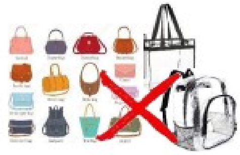
BAGS OF ANY KIND