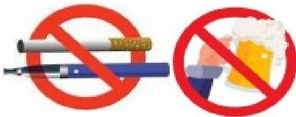
CIGARETTES & ALCOHOLIC DRINKS