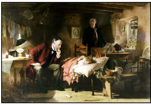
"The Doctor" by Luke Fildes, 1949.