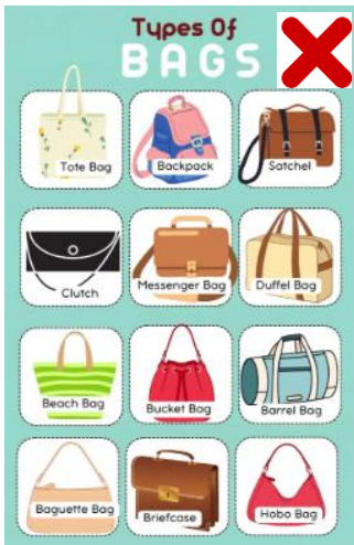
BAGS OF ANY KIND